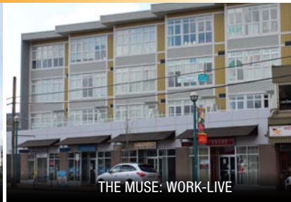
THE MUSE: WORK-LIVE

Only 10 square kilometers, the City of Langley is ideal for multi-family and mixed-use residential development.