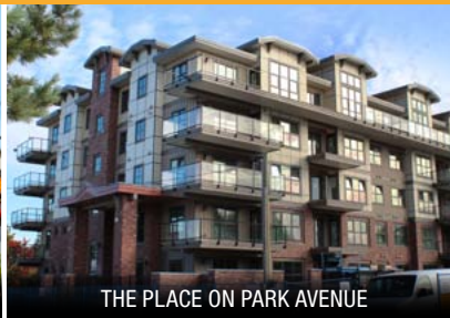
THE PLACE ON PARK AVENUE